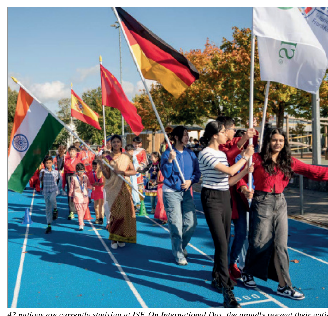
42 nations are currently studying at ISF. On International Day, the proudly present their national flags.

ISF, one of the most established international schools in Germany, prepares its graduates for a number of international external exams. In doing so, it is the only school in the Rhine-Main region and one of only a few in the